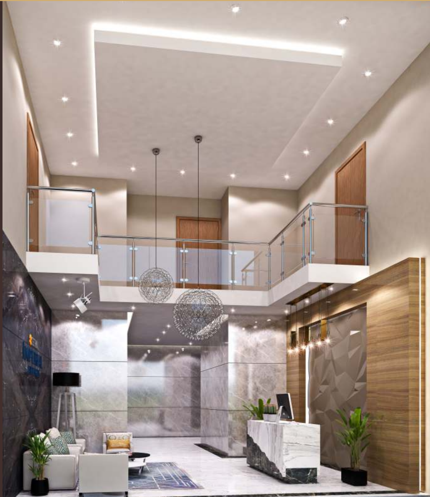
DOUBLE HEIGHT GRAND ENTRANCE LOBBY

Granite Kitchen Platform with SS Sink Modular Kitchen with Overhead Storage Designer Dado Tiles up to Lintel Level Aluminium Sliding Windows with exhaust fan Premium Quality Electrical Switches Vitrified Flooring Tubelight and Fan Fridge and Washing Machine