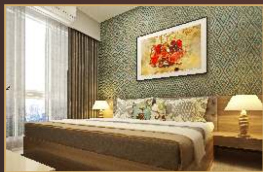
GUEST ACCOMMODATION FLATS