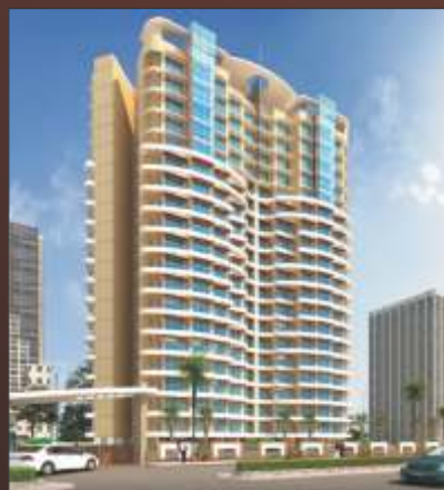
Sethia Link View - Goregaon (W)