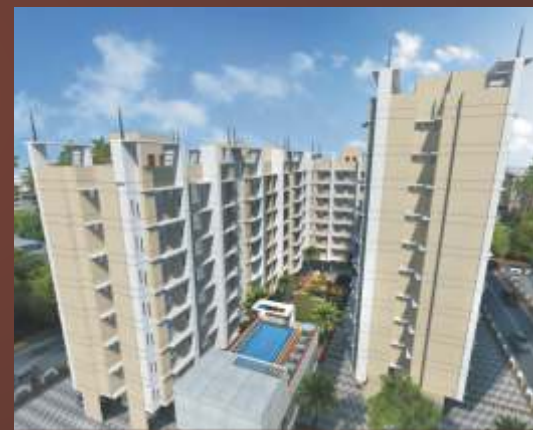
Sethia Green View - Goregaon (W)