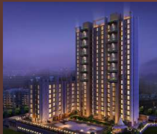
Sethia Sea View - Goregaon (W)