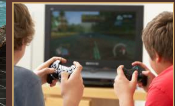
DIGITAL PLAY ZONE